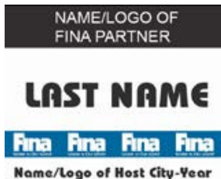
Award & Presentation Bibs

Only one FINA Sponsor may be displayed on Bibs. However, there may be one sponsor for men and another for women at the same Championships.