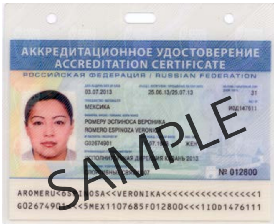
Sample of the Accreditation Certificate

The participants will have the right to enter/exit the territory of the Russian Federation under a visa-free regime during the period between July 15, 2015 and August 15, 2015 on the basis of an Accreditation Certificate issued by the Organising Committee free of charge.